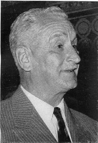
General Marcel Carpentier