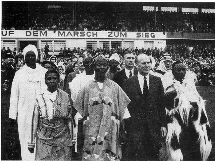
The African contingent enter the stadium. 'A revolution on the march to victory' reads the banner.