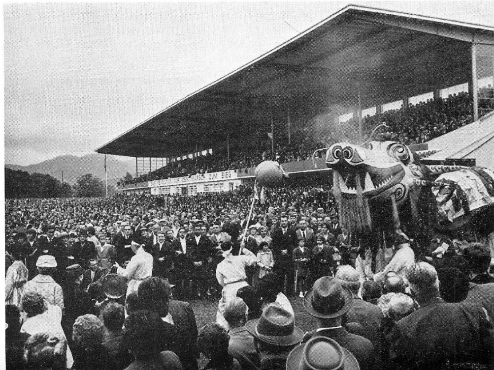
Free Chinese youth enter the Lucerne football stadium with their processional 'dragon'

Audiences totalling more than half the population of Schwyz took part in the offensive.