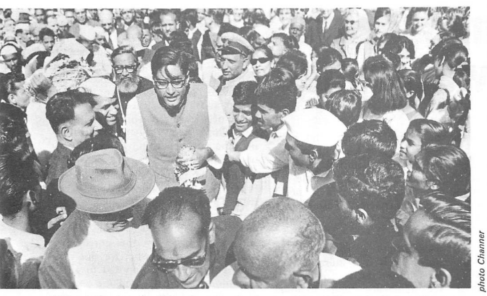
Above: Rajmohan Gandhi arrives for the inauguration of the Asia Plateau Centre