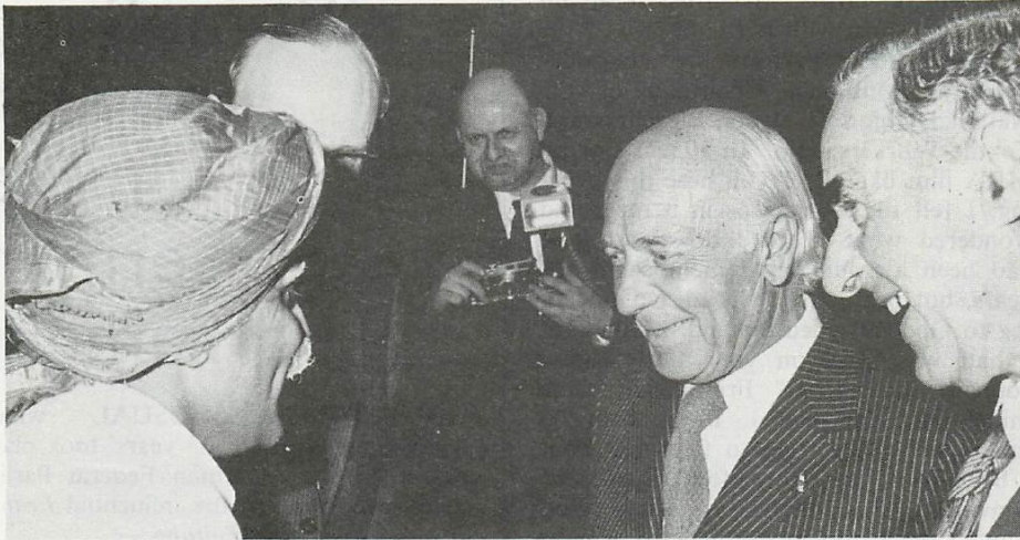
M Achille Peretti MP, former President of the National Assembly and Deputy Mayor of Neuilly sur Seine, meets the director of Song of Asia (dressed as an Indian village elder) after the Paris premiere.