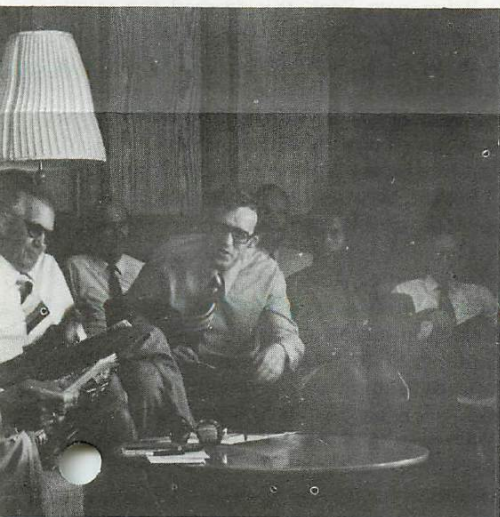
Young people during a previous session for Parliament.

had experienced that many convinced atheists lived a better quality of life than many Christians.