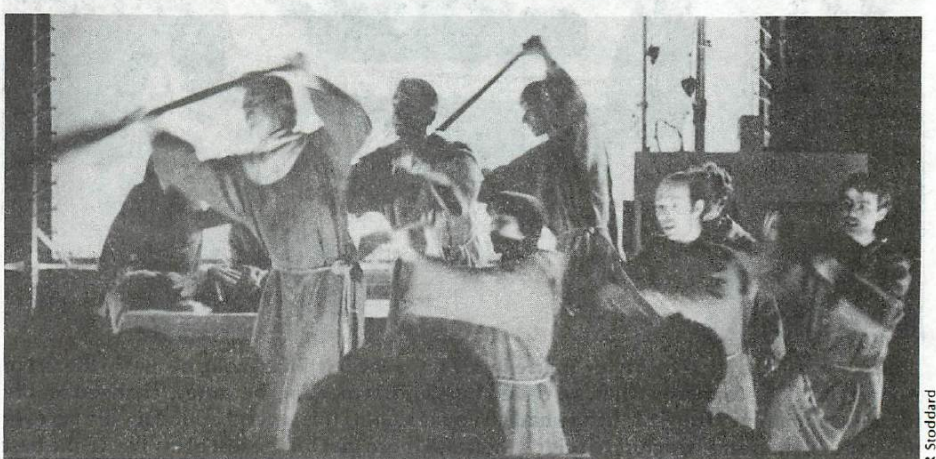
Scene from Columba at Wrexham

A pamphlet in Welsh on the life of Columba was printed especially for the North Wales tour. TEPW