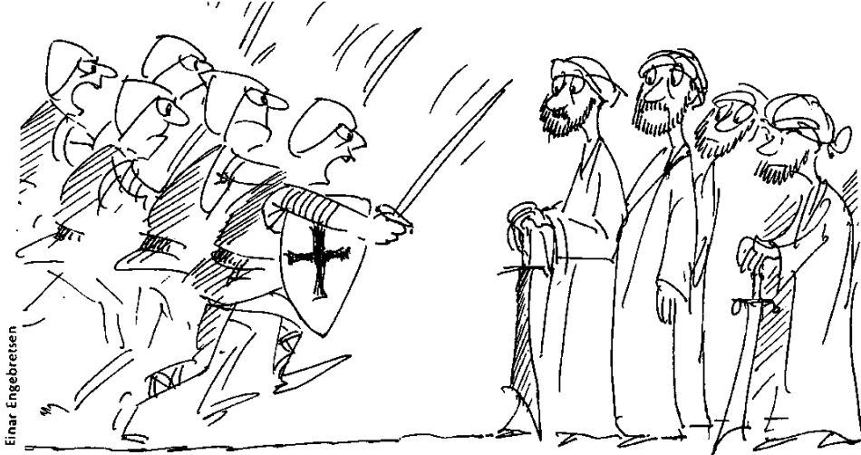
Muslims' impressions of Christianity owe more to Europe's armies than her missionaries.