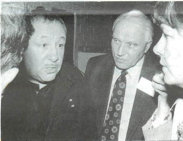
Ernst Neizvestny (left), Russian dissident and sculptor, introduced a showing of 'One Word of Truth', a film based on Alexander Solzhenitsyn's Nobel Prize speech, at the conference

'I enraged a person from the Middle East without knowing quite why,' said an American participant. 'As a result, I decided to learn a little of his country's history and our relationships with that people. I wrote him about what I was learning and my shame at some of the incidents. I had some amazing letters back and we became real friends.' Feelings were a real factor in such troubled situations as Central America, he went on, and needed healing, regardless of whether they seemed justified or not. 'Should we search for the things in our nations which have caused these feelings and identify with them, so that we can begin to bring an answer?'