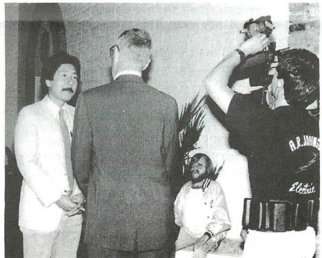
Three TV channels covered the opening meeting of the conference