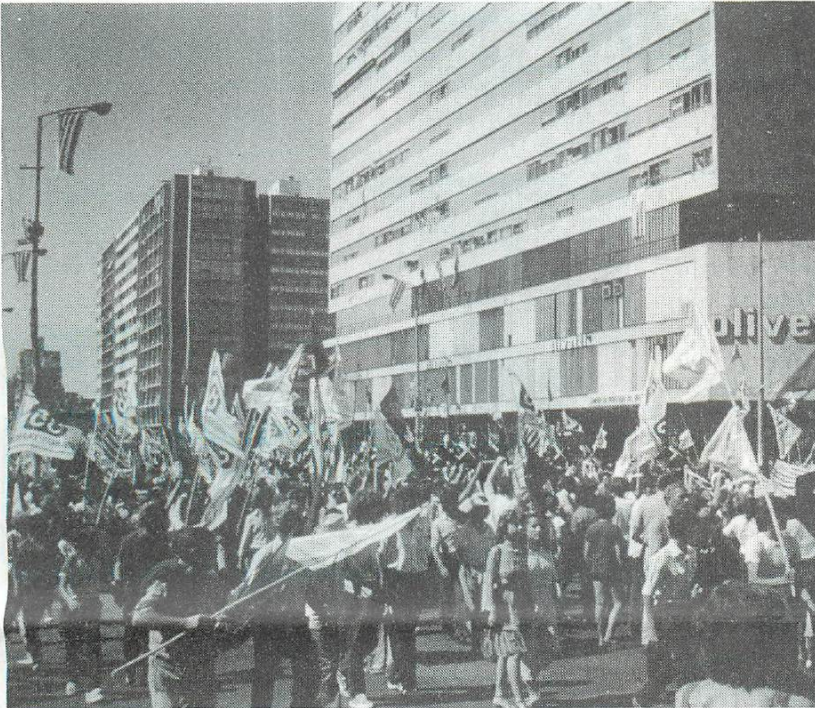
Crowds in the streets of Montevideo celebrate democracy's return to Uruguay.