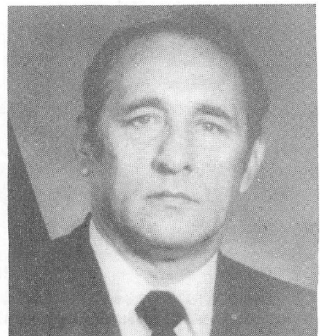
President José Napoleón Duarte

We also met members of the Catholic-inspired trade union movement, which is only two years old and has 60,000 members. Their leaders had taken part in the November seminar. They have launched a 'University of Peace' with the aim of training young workers in an alternative idea to Marxism. The first hundred who attended classes had to bring their own desks. The union president appealed for MRA books for a library they want to start.