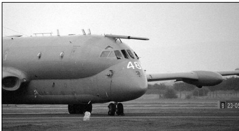
One of the Nimrod MR2s currently based at Kinloss

Plans for a medical centre at the base to be shared with Lossiemouth are well advanced. The true extent of the area's reliance on the bases is believed to be £100 million of the income generated by service and civilian jobs at the bases and spent in the area which is very much "defence dependent". It has also been revealed that more than 1,300 RAF spouses work in civilian jobs in Moray, concentrated on the local economy and the NHS. •