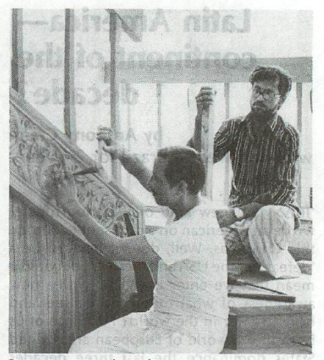
Carpenters at work on the staircase.

Some other students from Bombay went to see the state education minister and