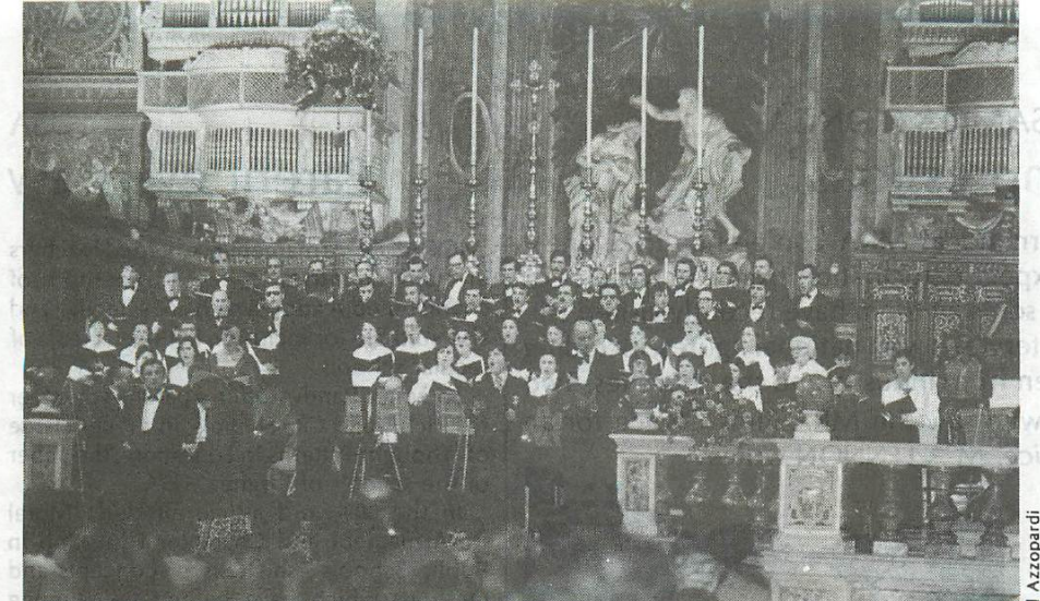
Oratorio for Our Time in St John's Cathedral, Valletta, Malta