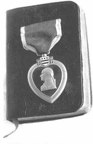
"When I woke the next day I found my New Testament on my bed with a box containing the Purple Heart medal."