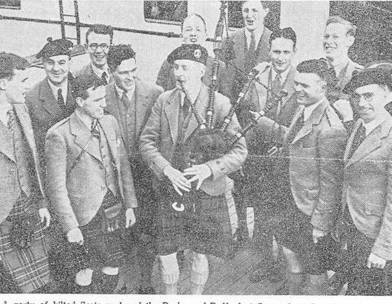
A party of kilted Scots on board the Duchess of Bedford at Greenock on Saturday en route for Canada and the United States on a two months' moral rearmament tour.