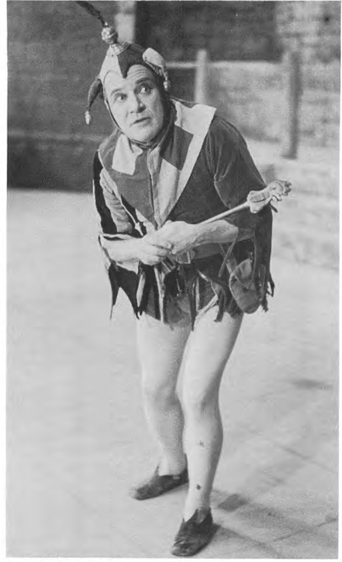
One of his favourite roles was that of Jack Point in The Yeomen of the Guard