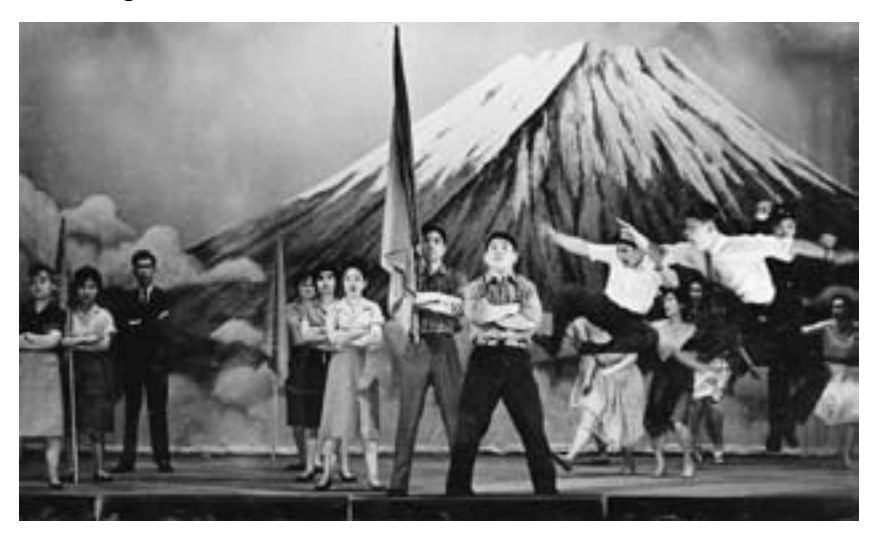
Scene from the play Beyond Communism to Revolution

Following its debut at Daiwa Securities Hall in Tokyo in June, Beyond Communism to Revolution toured theaters, universities, and Self-defense Force outposts all over the country including in the Kyushu, Shikoku, San'in, Kinki, Tokai, Kanto, and Hokkaido regions. An SDF transport was provided for the trip from Tokyo to Hokkaido, where, in the depths of winter, the company made the rounds of the majority of the SDF bases on the island. Between these domestic performances, the play also traveled to India in a twomonth tour starting in November.