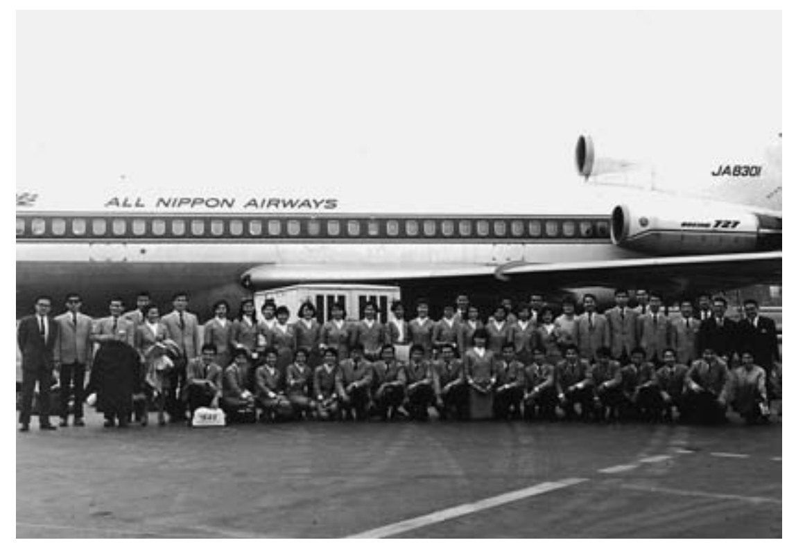
The students while traveling in Japan