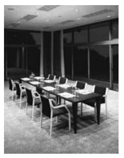
New Asia Center: Akebono ("dawn") dining room