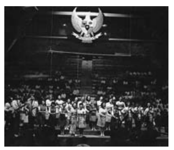
Concert in Jakarta