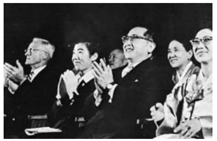
Korean prime minister Jeong Il-gwon (second from right) and family applauding "Sing-Out '65" at the world assembly in Seoul, accompanied by U.S. ambassador Winthrop G. Brown (left)

Fuji School in Gotenba, Shizuoka prefecture, moving on after the close of sessions to the Kansai region to perform at Kobe Central Gymnasium before an audience of 5,000. Next the cast boarded a ferry from Kokura in Fukuoka prefecture to South Korea, where they had been invited by Prime Minister Jeong Il-gwon. At this time the world assembly, too, switched venues from Odawara to Seoul, reconvening for an additional session