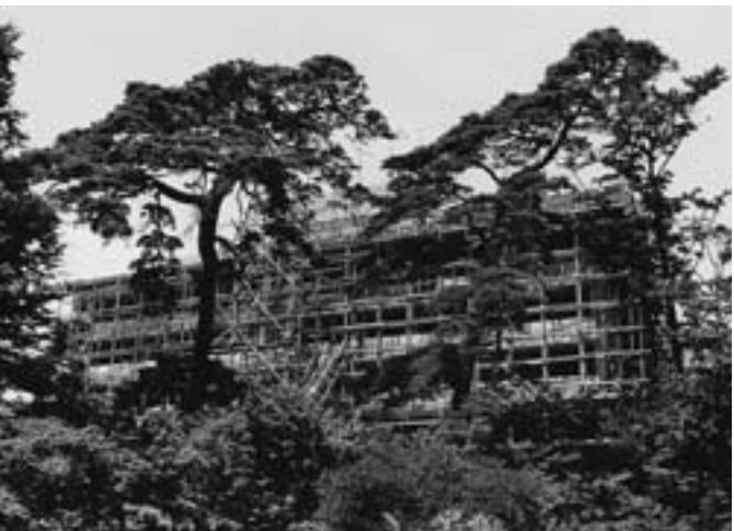
View from the southeast side