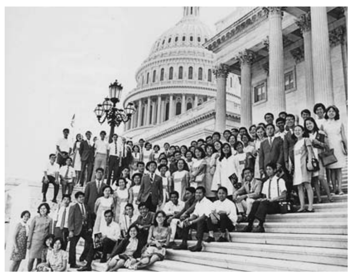
Members of "Sing-Out Asia" visiting the U.S. Capitol in Washington, D.C.