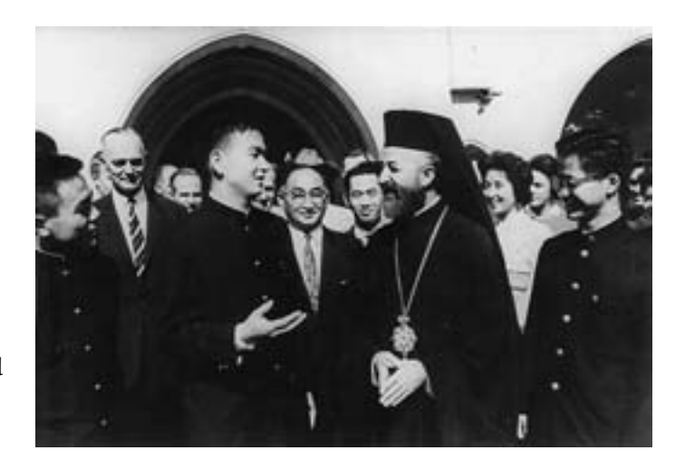
President Makarios III (second from right) of Cyprus greeting the Tiger delegation