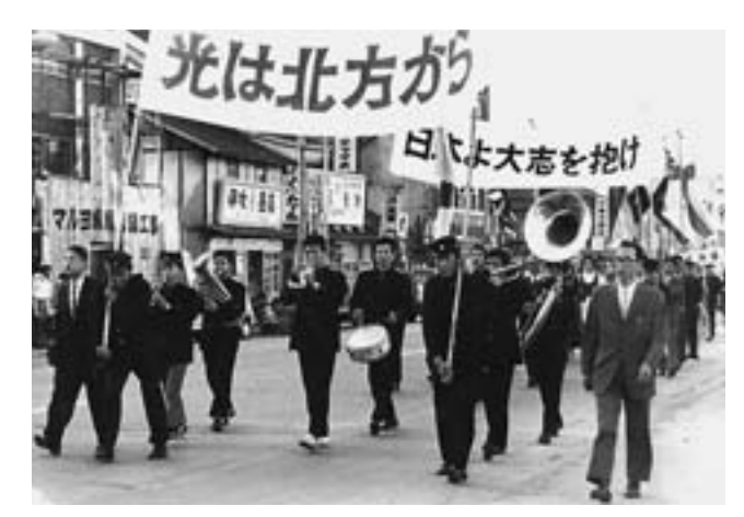
Parade in Hokkaido

The Sapporo performance of Beyond Communism to Revolution inspired a group led by students from the Sapporo Koran Girls' High School to draw on their personal experiences to create the musical Hikari wa hoppo kara [Light Springs from the North] in 1964 and Hokkyokusei [The North Star] in the following year, both performed not only throughout Hokkaido but also in Odawara and Tokyo. These works, together with the play Asu dewa ososugiru [Tomor-