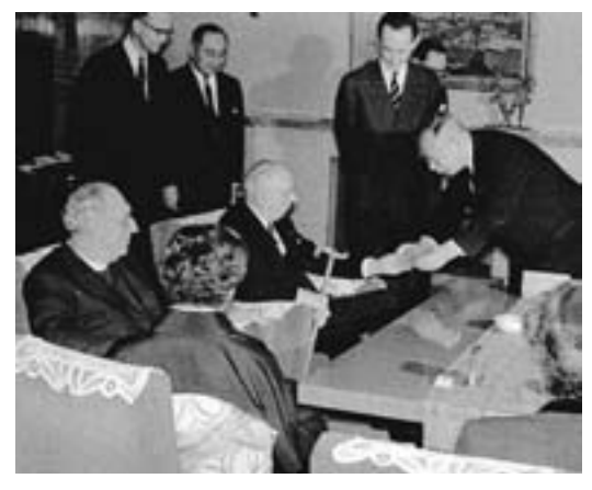
Governor of Tokyo Yasui Seiichiro (right) presenting Buchman with keys to the city