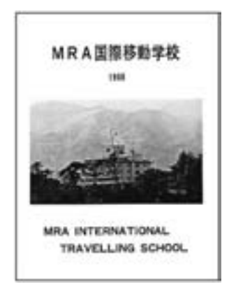
Catalog for the MRA Travelling School (renamed the MRA International Travelling School in 1968)