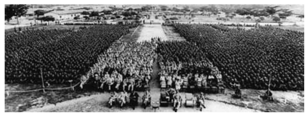
Performance before South Vietnamese soldiers