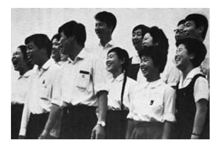
Odawara high school members of the play Judai no bakuhatsu [Teen Explosion]

In summer 1965, the youth involved in the above plays traveled to the Mackinac MRA world assembly as part of a 100-member delegation that included 18 high school and 25 university students accompanied by eight university students from South Korea. Hokkyokusei was performed at Mackinac, Charleston, Santa Fe, and elsewhere, all to great acclaim. Asu dewa ososugiru was adapted for film at Mackinac.