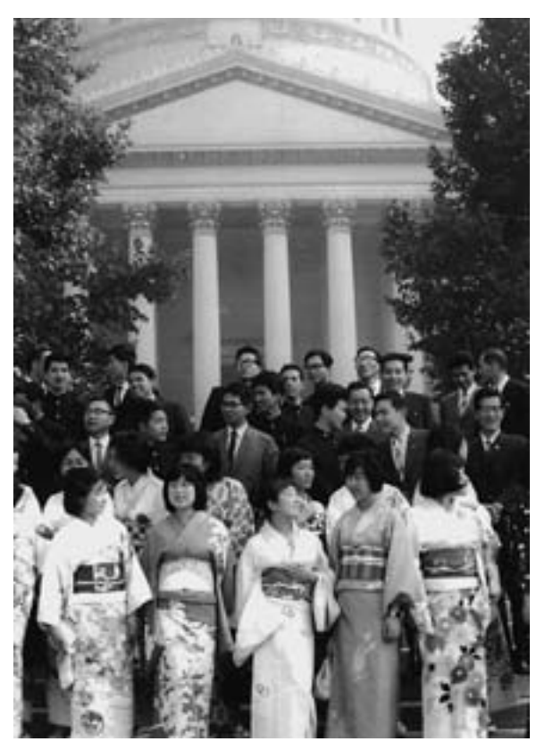
Summer 1965: The youth delegation visiting the West Virginia State Capitol