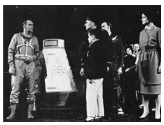
Scene from Space Is So Startling : "The simple master plan ending the fear of war and strife and re-uniting man"