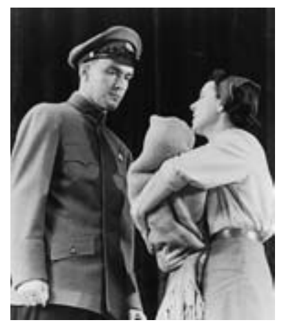
Scene from the play