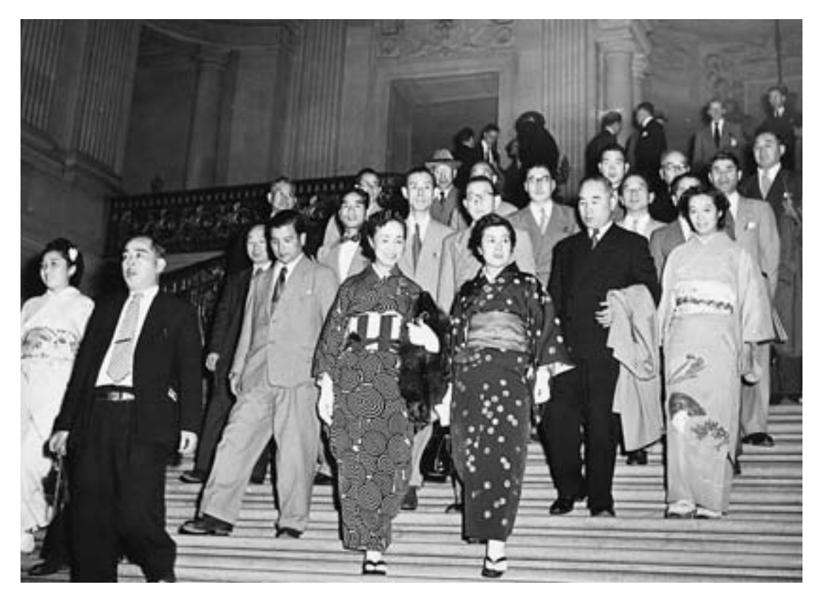
July 1951: The 1951 Japanese MRA delegation at San Francisco City Hall following a visit with the mayor