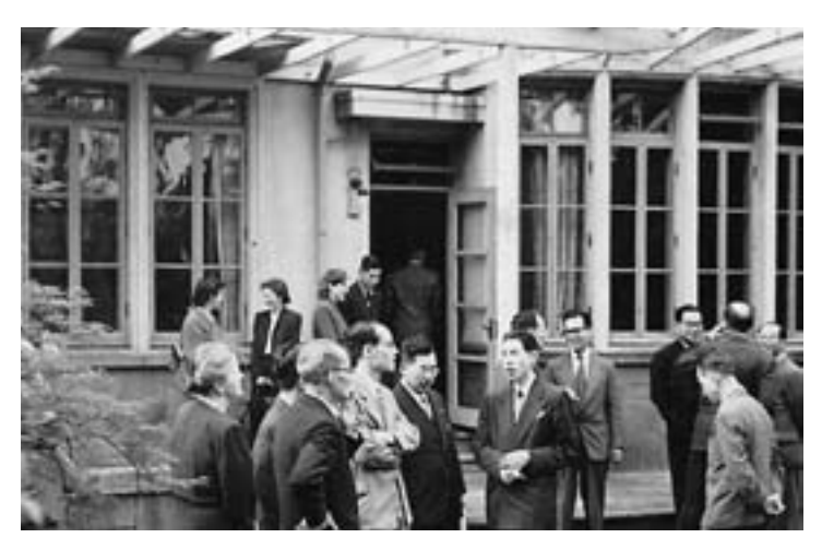
The MRA House verandah

legal status by the Ministry of Education, Science and Culture in March 1952. The voluntary Association of MRA Supporters was also established to help raise funds for MRA activities, thereby providing an apparatus through which to accept regular donations from the many corporations that had signed on as members.