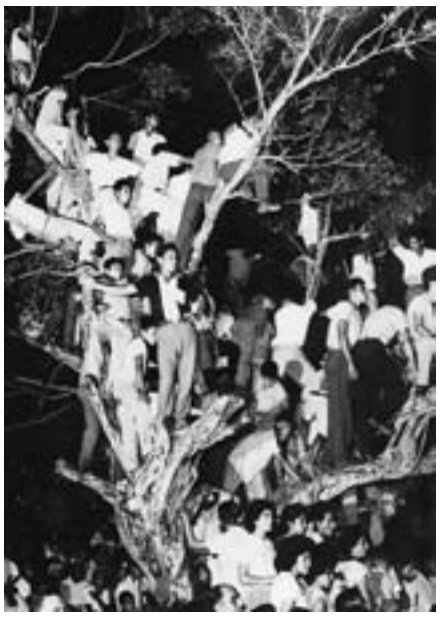
An audience at Iquitos, near the upper reaches of the Amazon River in eastern Peru