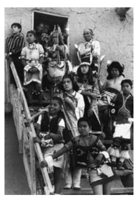
Residents of a Native American reservation in New Mexico attending a performance of Hokkyokusei [The North Star]