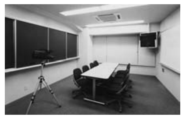
New Asia Center: Seminar room