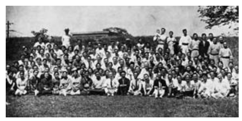
August 24, 1928: Conference of Japanese Oxford Group participants in Gifu

Gakuin and First High School. With the attack on Pearl Harbor and the outbreak of war between Japan and the United States in 1941, however, he was deported, effectively putting a stop to the MRA movement in Japan until after World War II.