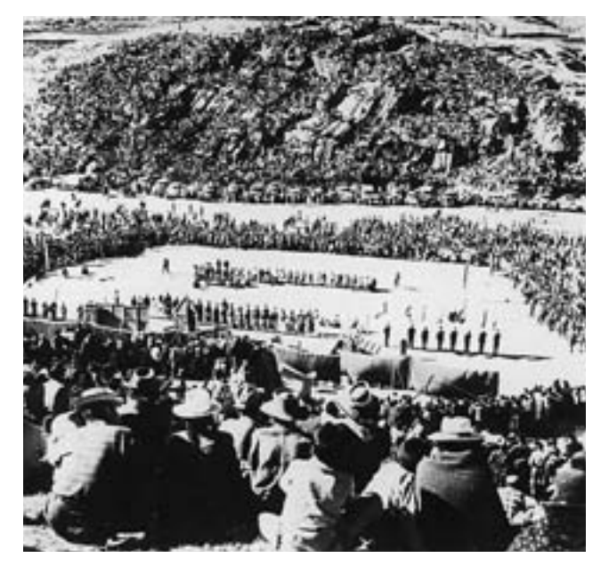
Performance given in the local language of Quechua before 40,000 native Peruvians at the ruins of the Incan fortress of Sachsaywaman

The outcome of these reflections was the play Tiger , written and produced in the serenity of Caux by a group of student-led Japanese assisted by theater professionals. At first the group, which included Diet members from the Liberal Democratic Party and labor activists with no affiliation to Zengakuren, staged the play at Caux Mountain House, intending it to serve as no more than a primer on the background to the 1960 demonstrations for the international audience gathered there. Yet the play evoked a much greaterthan-expected response, and before anyone knew it the project had grown into a tour of unprecedented scale that left Caux in August, going quite literally around the world, from Europe to North and South America, Cyprus, India, Vietnam, and Taiwan, and performing in 13 countries and regions in front of an estimated 20 million people before returning to Japan two years later toward the end of June 1962. For more details on these developments, hardly believable even to the participants themselves, see Sohma Fujiko, Tora sekai o yuku [ Tiger Goes around the World], Bunkyo Shoin, 1962.