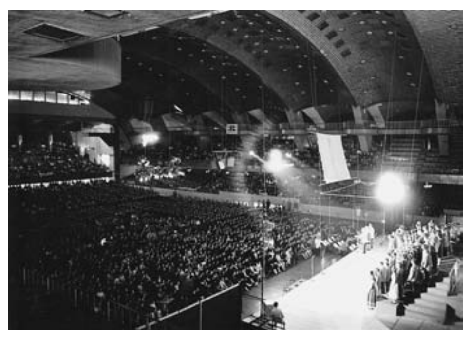
Concert at Tokyo Metropolitan Gymnasium