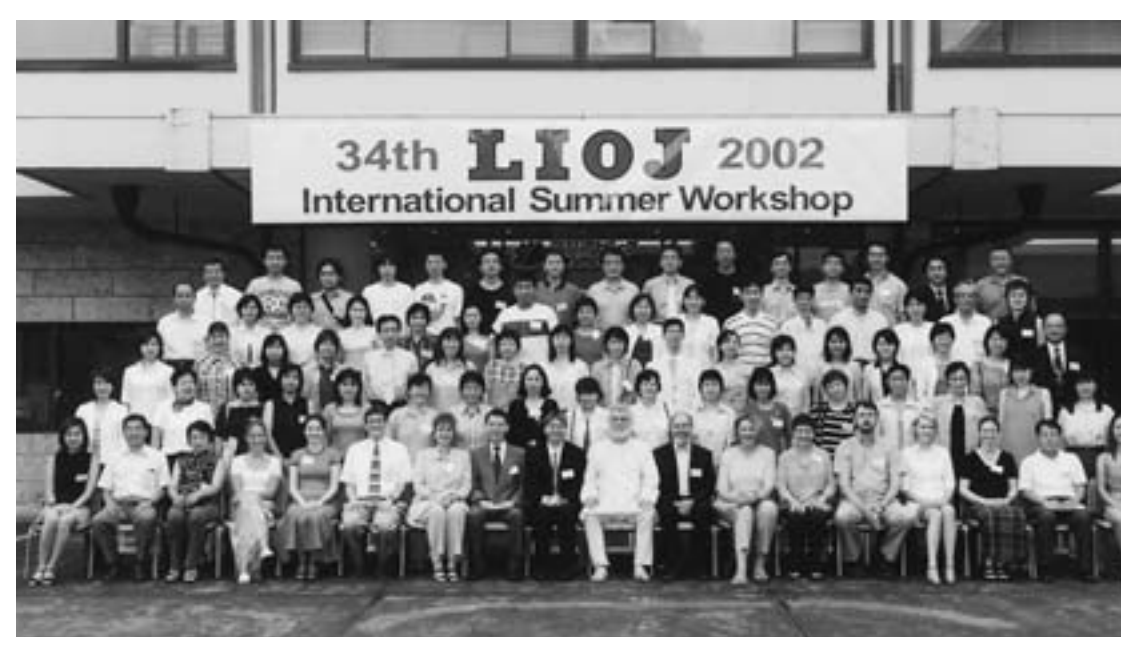
LIOJ 2002 summer workshop

collaborated with Srinakharinwirot University in Thailand to organize a series of teamteaching exchange programs for English-language educators held in both countries that altogether trained 36 participants. Meanwhile, the English day classes also offered by LIOJ for nearby residents since 1971 were attended by a total of 18,510 students ranging from school-age children to adults as of 2002. Other recent LIOJ projects included camps for high school students and team-teaching programs at public schools in Hakone-cho and other neighboring areas.