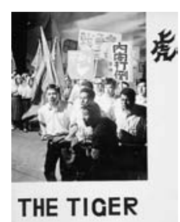
Scene depicting Zengakuren students leading a demonstration near the Diet Building