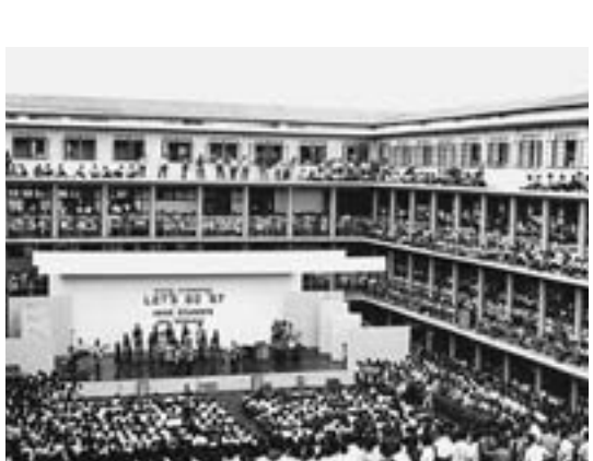
Concert in Manila