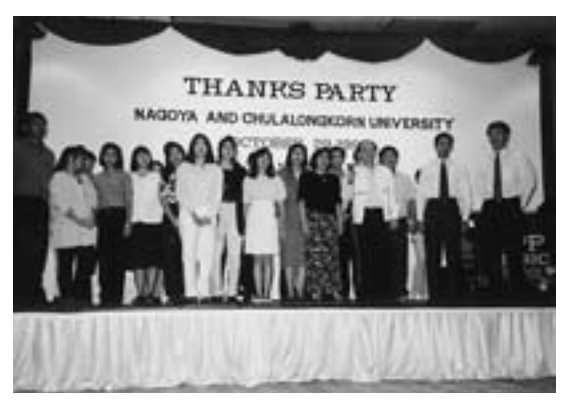
October 1993: Students from Nagoya University on a visit to Chulalongkorn University in Thailand