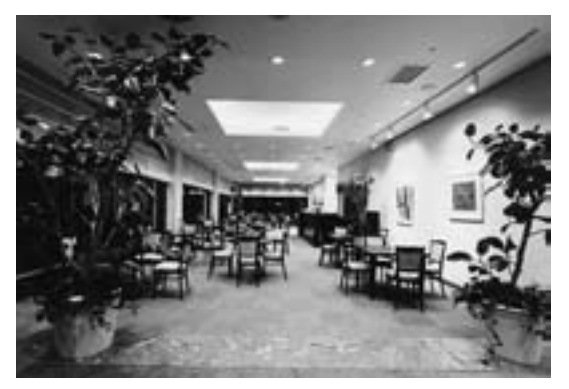
New Asia Center: Cafe Alcantara