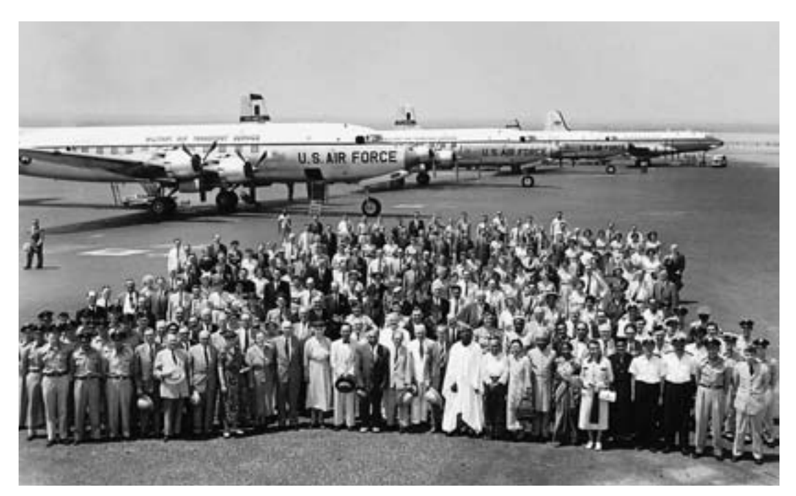
Members of the Vanishing Island delegation in front of their U.S. Air Force transport plane

Following World War II, MRA frequently turned to theater, film, and other audiovisual media to help disseminate its ideals among the public. Such media offered a means to dramatize subtle feelings and moral truths that could not be captured in words alone while also drawing on visual images to appeal directly to people's sensibilities. Compared to dialogue sessions or lectures, they also enabled contact with wider and more general audiences, who, touched by the messages conveyed, often responded in ways greater than expected.