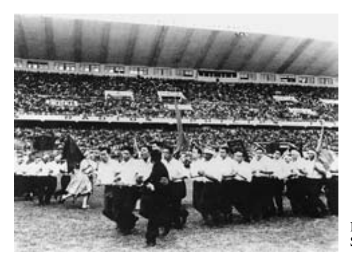
Performance at the National Stadium in Lima