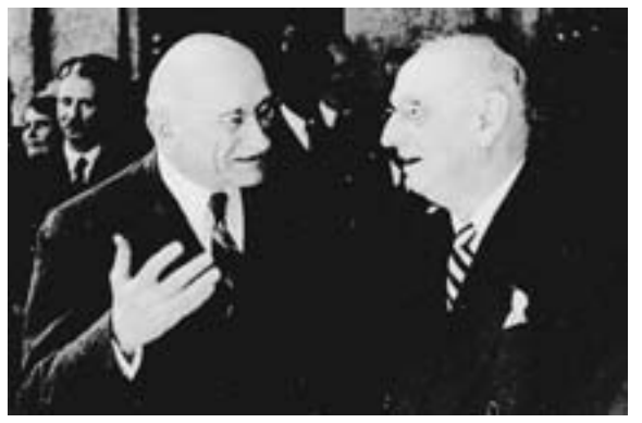
French foreign minister Robert Schuman (left) at Caux