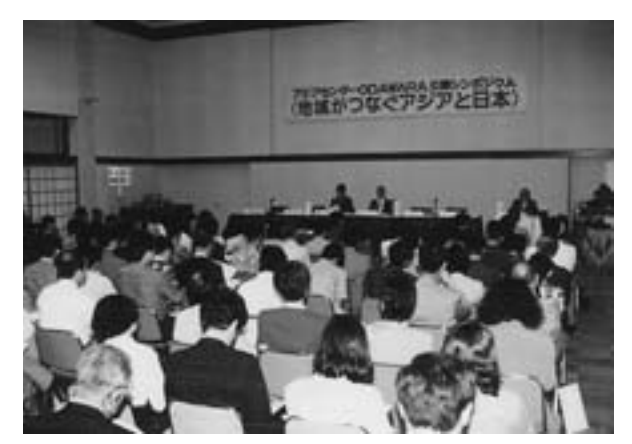
Open symposium "Grassroots Initiative to Bring Asia and Japan Closer Together"

In 1993, the MRA Asia Center underwent refurbishments totaling nearly 1 billion yen to deal with the wear and tear of the 30 years since its opening in 1962. Following extensive work including complete overhaul of the lodging accommodations, construction of new Cafe Alcantara and Akebono dining rooms, and remodeling of the office, kitchen, and other facilities, the building, now renamed Asia Center Odawara, reopened as a community guest and seminar house in an April ceremony attended by Odawara Mayor Ozawa Yoshiaki among others. To further commemorate the opening, in June the center held a major international symposium entitled "Grassroots Initiative to Bring Asia and Japan Closer Together" that invited 36 Japanese and foreign panelists from a wide range of specialties for stimulating debate on the present and future of NGO and other forms of international cooperation.