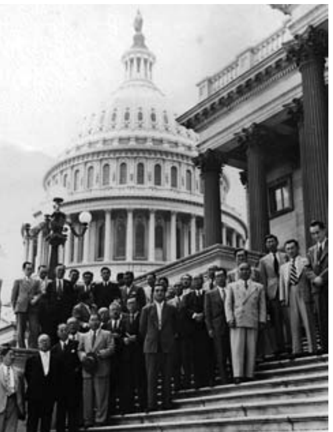
The delegation at the U.S. Capitol