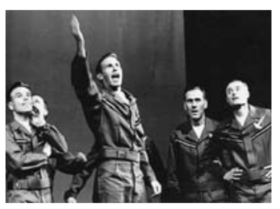
Scene from Space Is So Startling : "We've got to be first. We'll get to the Moon this time—or burst!"