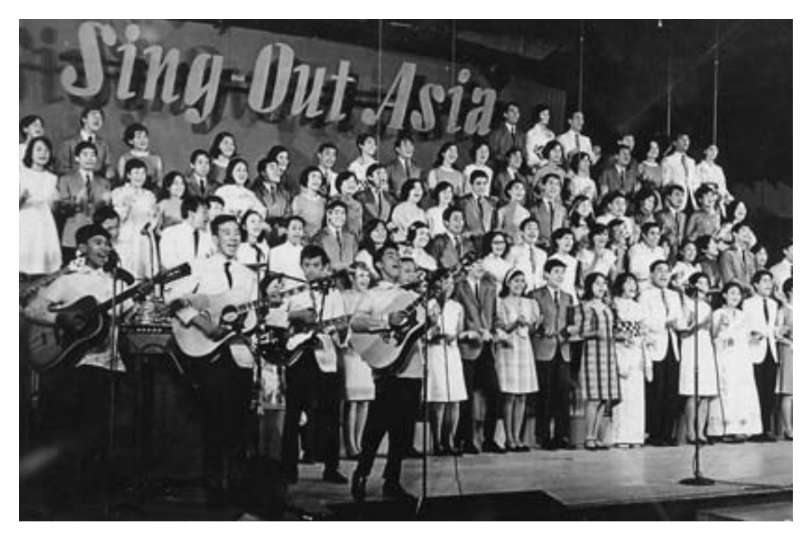
The "Sing-Out Asia" company onstage

In July 1968, students from the MRA International Travelling School joined young people from South Korea, Thailand, Hong Kong, and the Philippines to form the 150member troupe "Sing-Out Asia," using the auditorium of the MRA Asia Center to put together a program that they then took with them by chartered Pan American DC8 plane to the United States. For roughly three months before heading home in October the group toured the United States, starting from San Diego on the West Coast and traveling through the Midwest to the Atlantic to visit and perform in 35 cities in 22 states along the way. Acclaimed wherever they went, the members traveled across the continent and back aboard four tour buses and two trucks and stayed with private families at each stop, managing to cover most of their plane, luggage, and other expenses by selling out the approximately 40,000 LPs they made from a master recording prepared while in Japan. Contributing to the tour's success from behind the scenes, meanwhile, were U.S. MRA supporters, who helped arrange for everything from transportation, performance venues, and stage and lighting setup to accommodations for the performers.