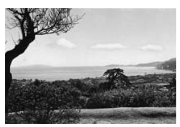
View from the former Kan'in villa looking out over Sagami Bay

Once the organizers met the owner and confirmed his willingness to sell the villa on the condition that it would be used for the public good, things moved forward rapidly. In