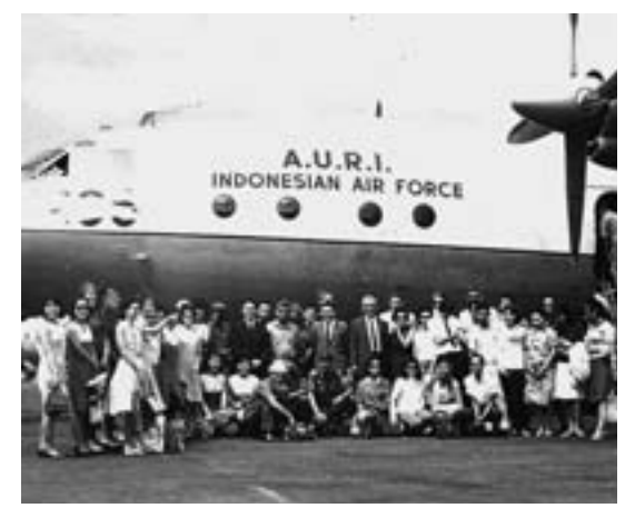
The company upon their arrival in Bandung aboard an Indonesian Air Force transport