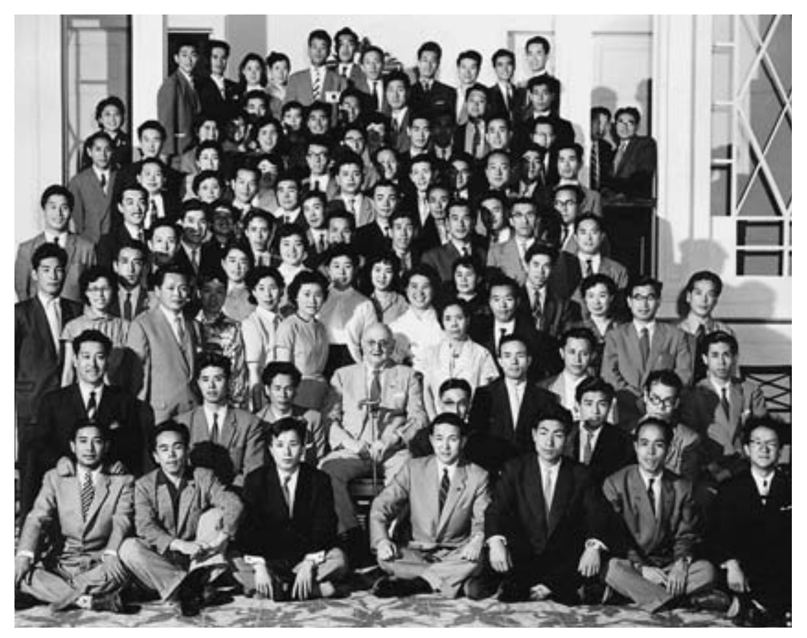
Frank Buchman with officers of the Japan Seinendan Council

Alarmed by what it saw as a strategic campaign by international (particularly Chinese) communists to approach and sway Japanese leaders in different fields, MRA resolved to counteract this influence by spreading awareness of a better alternative to communism.