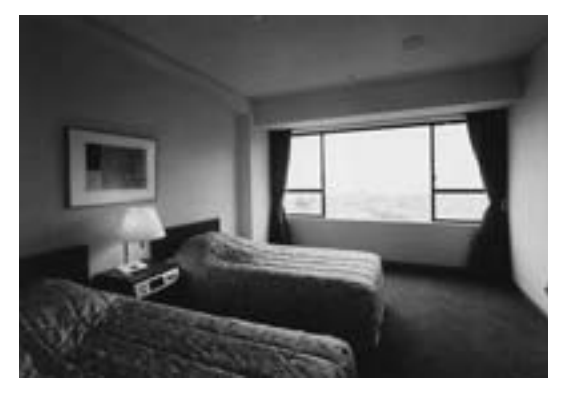
New Asia Center: Room accommodations