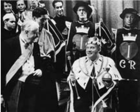
Scene from the play: The Land of I Love Me