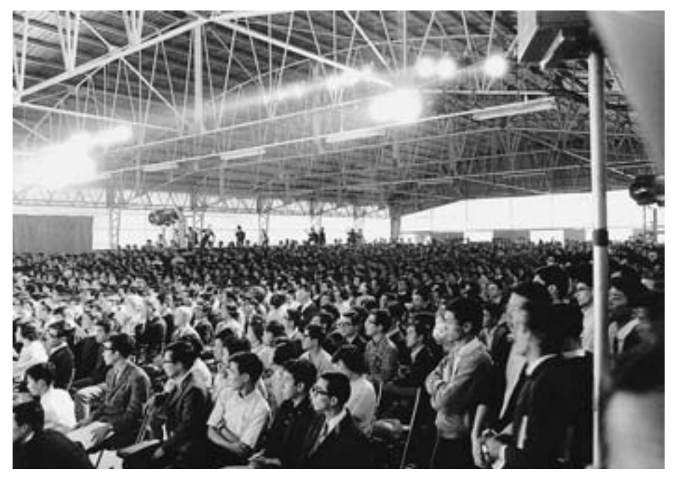
Concert at Sophia University