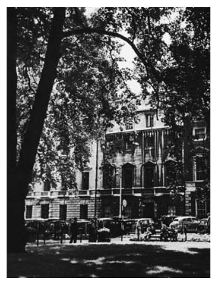
45 Berkeley Square, London

The construction of the MRA Asia Center was completed in October 1962, one and a half years after Buchman passed away. His charisma continued to inspire people, and a splendid building was completed even after his death. The fund-raising magic that he had been able to wield, however, finally dissipated, and by the time the center opened, it had a huge debt of 200 million yen in the monetary value at that time. Later, it became difficult even to raise funds for the building's operating expenses, but thanks to strenuous and persistent efforts, the center's mortgage was finally paid off in full 30 years later, in 1990. For