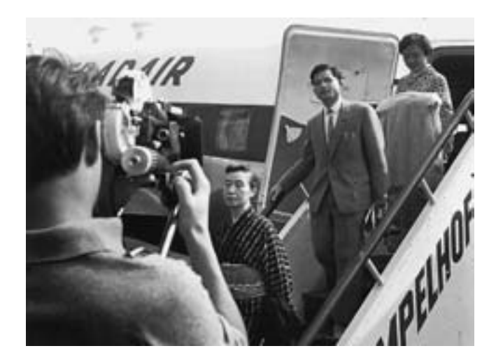
The group upon arrival in Berlin

on chartered planes to accomplish their tight schedule of visiting seven countries in two weeks.