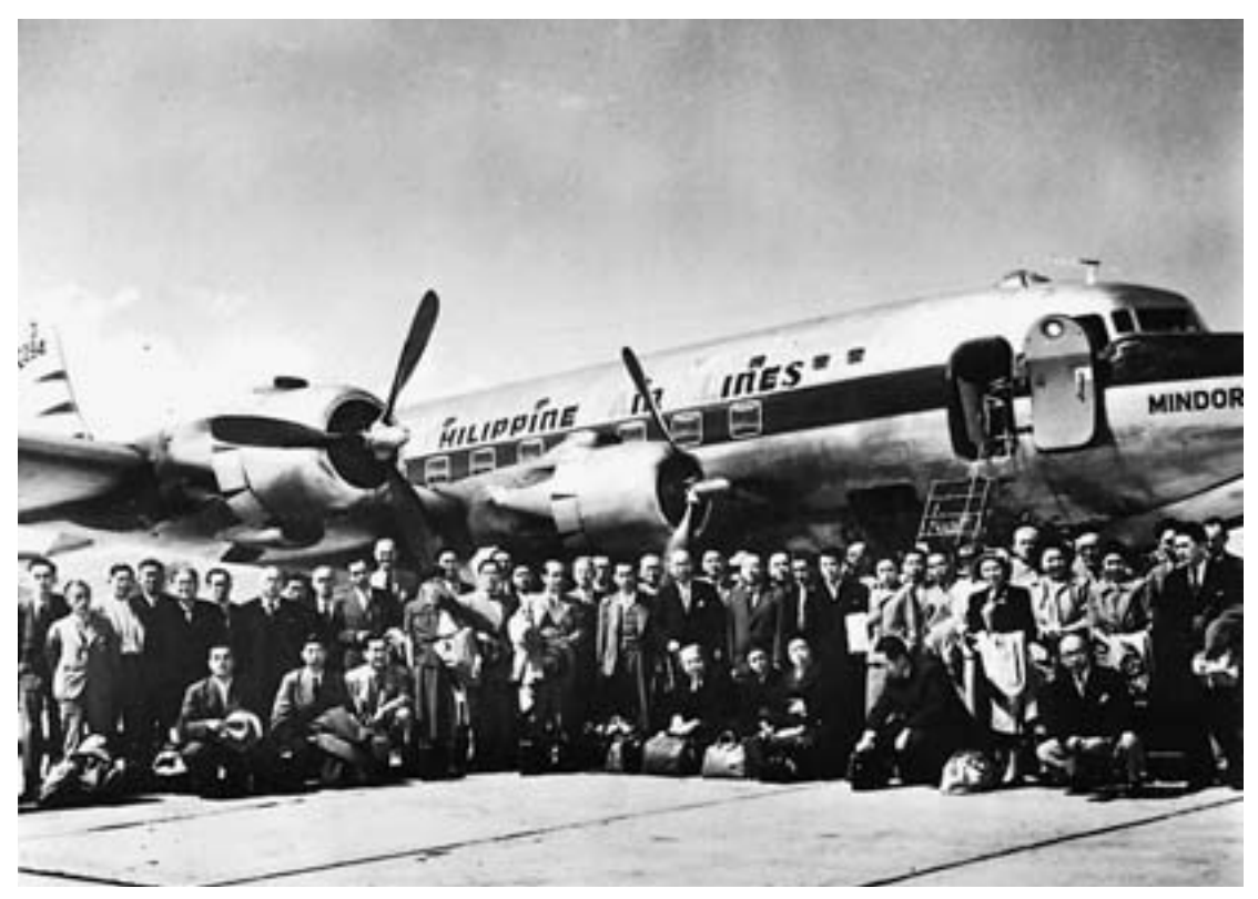
The delegation upon arrival in Geneva

A group of MRA supporters including Frank Buchman was waiting outside the front entrance of the building, where the visitors were welcomed by an international chorus singing the Japanese anthem. It is all too easy to imagine how moving this warm reception by Buchman and his fellows must have been for the delegates, still disheartened by their