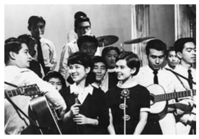
Members of "Let's Go '66" performing on the Yoshinaga Sayuri Show (Nippon Television)

The pioneering format and forward-looking messages of "Sing-Out '65" were enthusiastically embraced by Japanese and Korean youth, and in Japan a parallel show entitled "Let's Go" was created that traveled around the country before embarking on a 1966