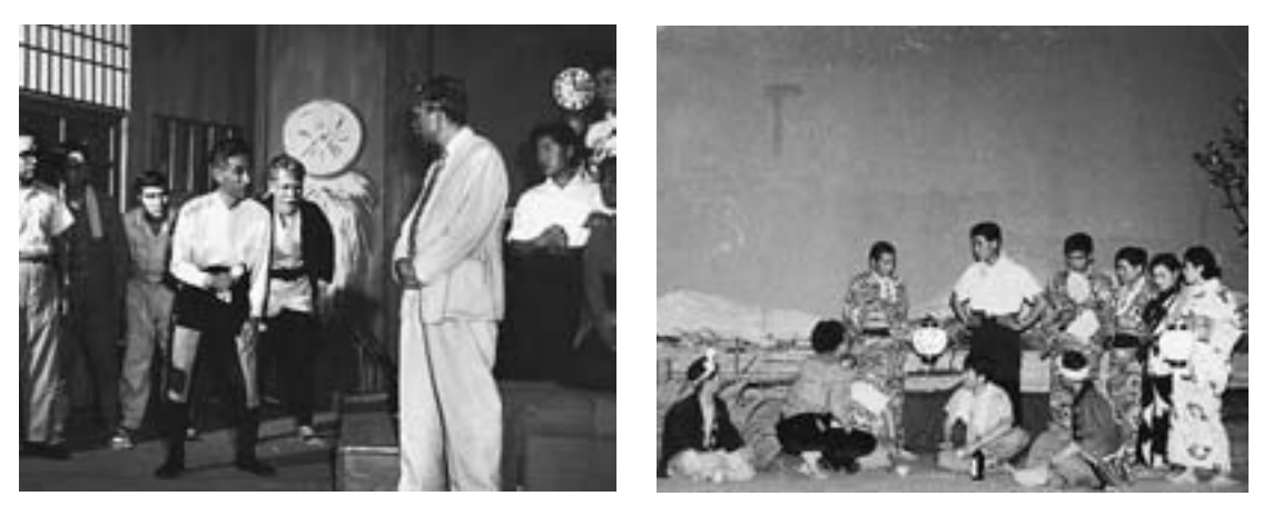
Scenes from the play Asu e no michi [The Road to Tomorrow]

The news that over 100 Japan Seinendan Council officers, including those from the headquarters as well as two from each of the prefectural branches, would travel en masse