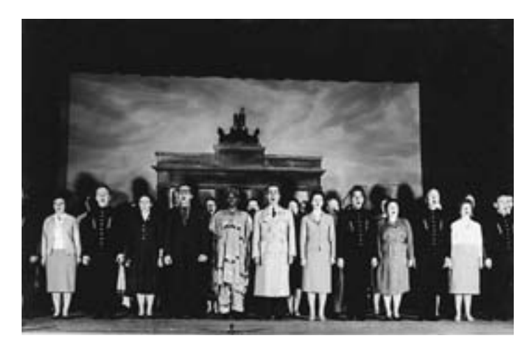
Scene from the play Hoffnung

Foremost among the many ideologically based confrontations polarizing Japan during this period were those involving labor and management, of which the 1959–1960 Miike coal-mine strike in Kyushu was one of the most violent and protracted. Hoping to contribute to a resolution of the situation, MRA arranged a Japanese tour of Hoffnung [Hope], a play written and performed by a group of coal workers from Germany's Ruhr region. The group arrived at Haneda Airport on March 14, 1960, for a seven-week stay, traveling mainly aboard the trains offered by the Japan National Railways from Tokyo via the Kansai region to Kyushu, then back again through Tokyo and north to Hokkaido before leaving on May 4 for the United States. During the tour, the troupe staged the play before a total of 49,000 people in 42 performances including special sessions for Japan National Railways employees and members of the police, the Self-Defense Forces, and