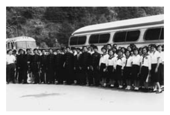
Summer 1965: The youth delegation in the United States