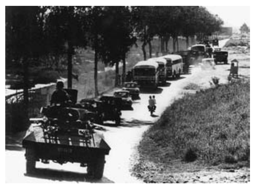
The delegation heading for Vinh Long, one of the battlefields of the Vietnam War