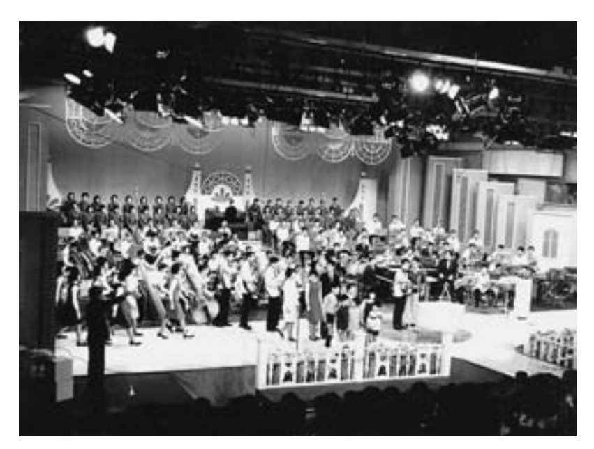
Performing on the NHK program Ongaku no hana hiraku [The Flowers of Music Abloom]