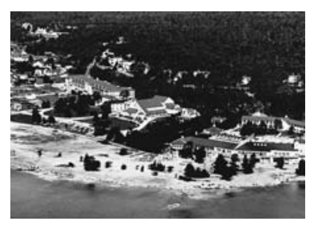
Bird's-eye view of the MRA headquarters on Mackinac Island

While similar programs for inviting and winning over foreign opinion leaders already existed in many organs of the free-world camp including the U.S. Department of State, to MRA these attempts seemed on the whole much too formulaic and bureaucratically run to be effective. Buchman therefore launched his own largescale project to invite 100 officers