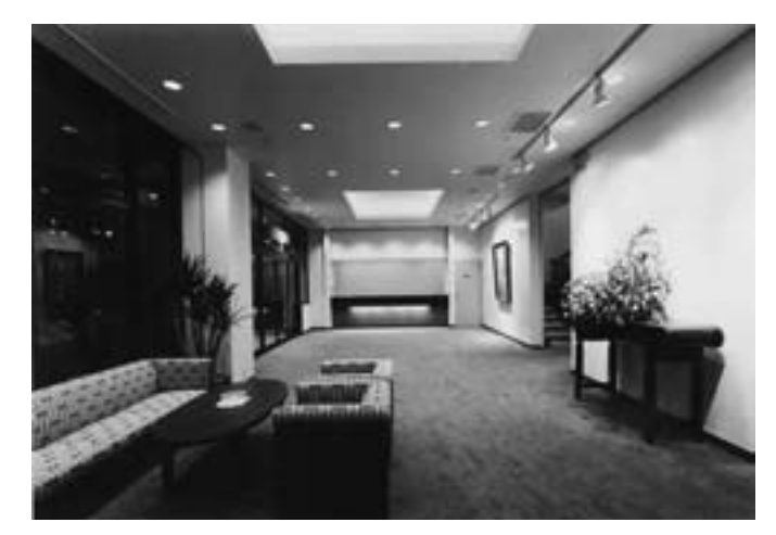
New Asia Center: Lobby