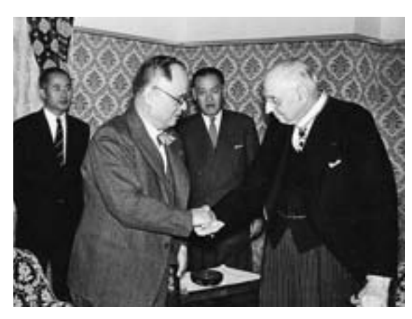
Foreign Minister Shigemitsu Mamoru (left) presenting Buchman with the Order of the Rising Sun, Gold and Silver Star