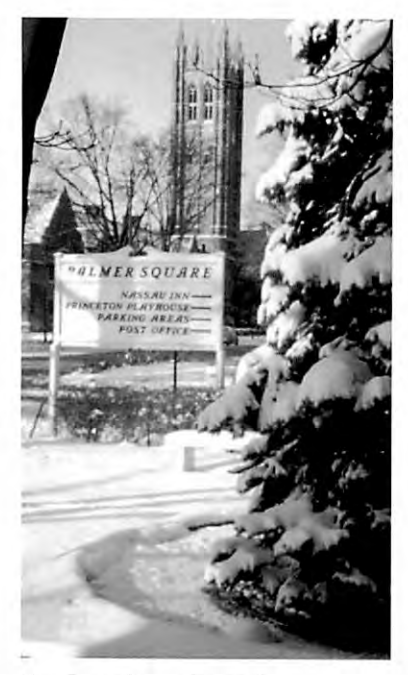
I enjoyed my days at Princeton, making many new friends, opening the riches of the classics to an enquiring new generation, and reaffirming my love of the academic environment.