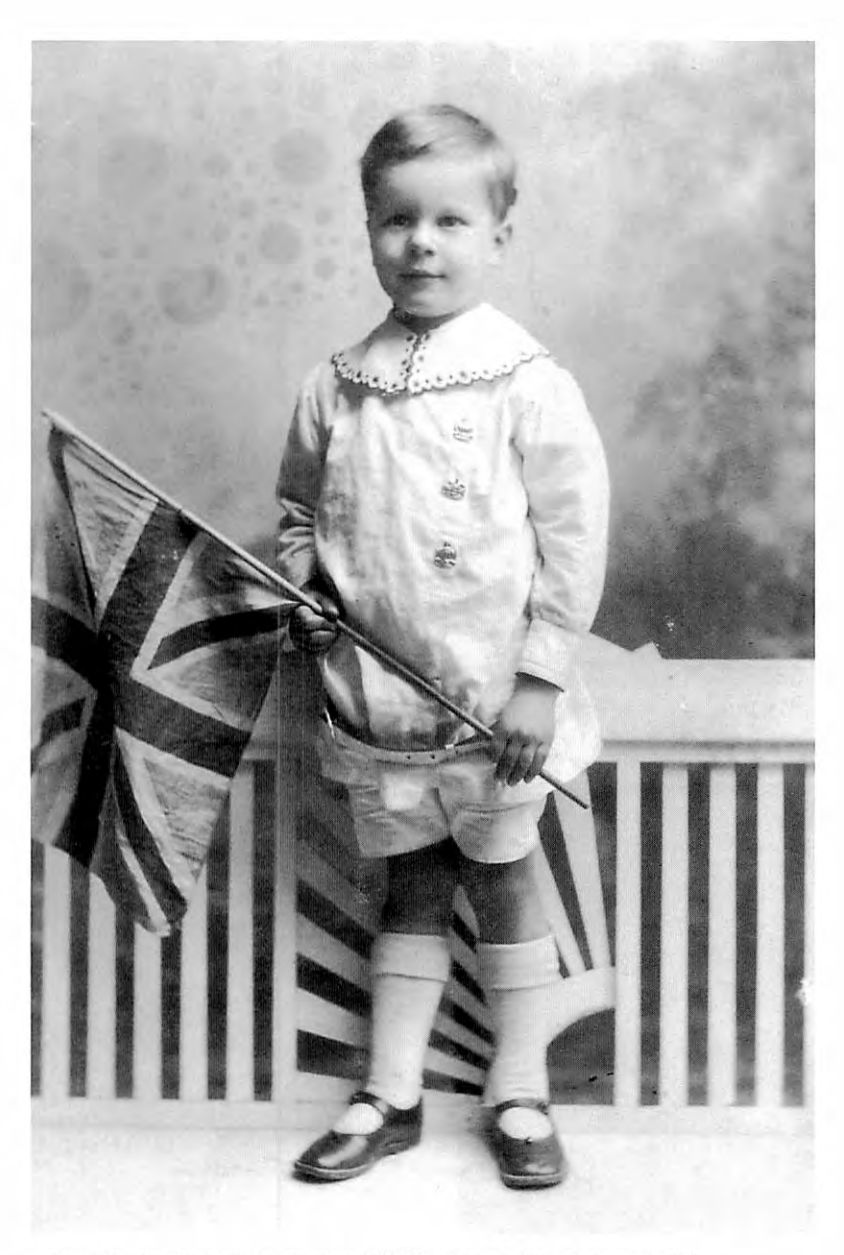
Age Five? Certainly during WWI, hence the Union Jack!