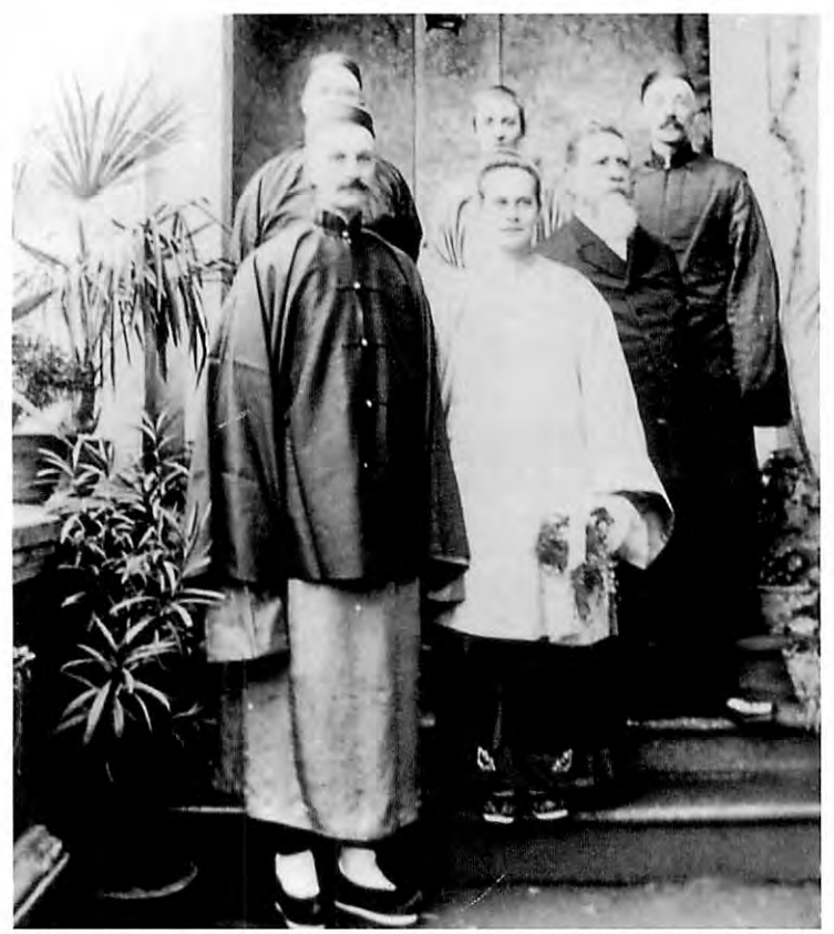
My parents' wedding in Hankow, China, 1900. China Inland missionaries wore Chinese dress and lived as Chinese.