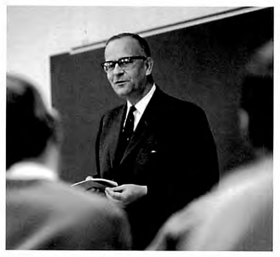
Teaching in the classroom; always an adventure.