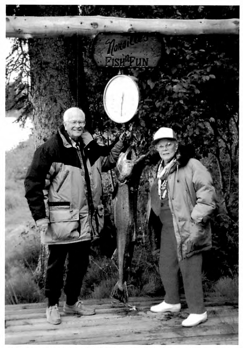
An Alaskan adventure landed us a 50 lb. King salmon.