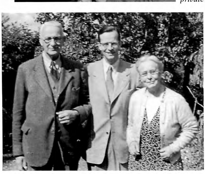
Buchman and private secretary.