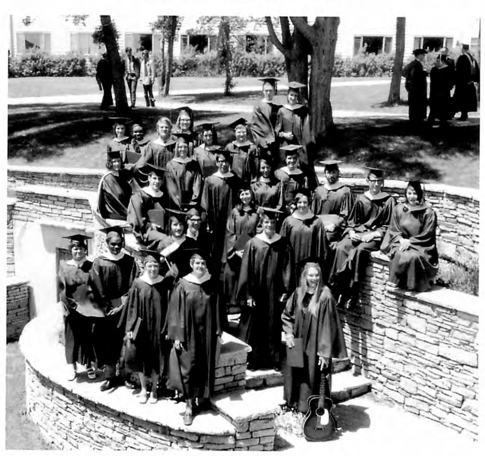
Commencement Day at Mackinac, June, 1970.