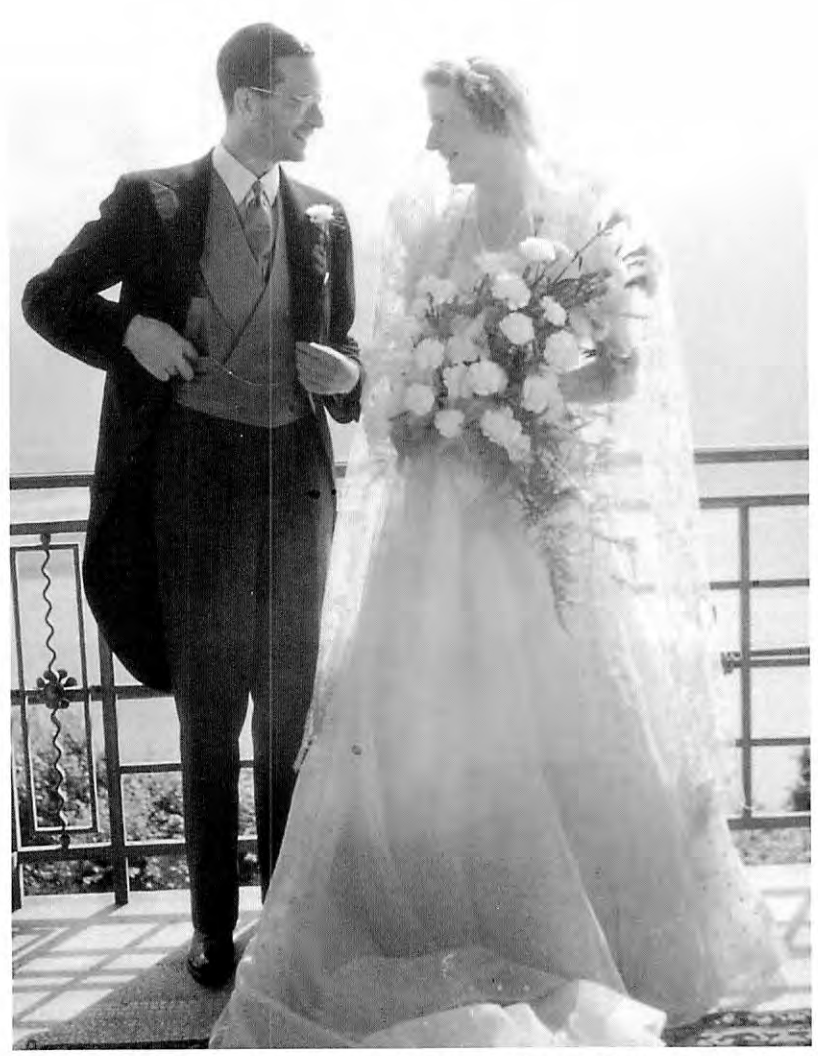
Wedding Day, August 15, 1946, Mountain House, Caux, Switzerland.