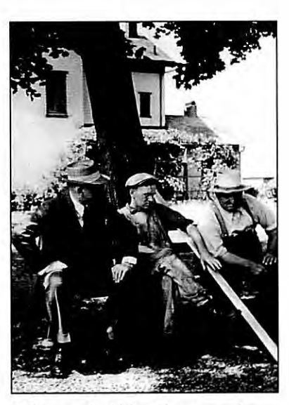
Talking with old friends in Pennsburg.