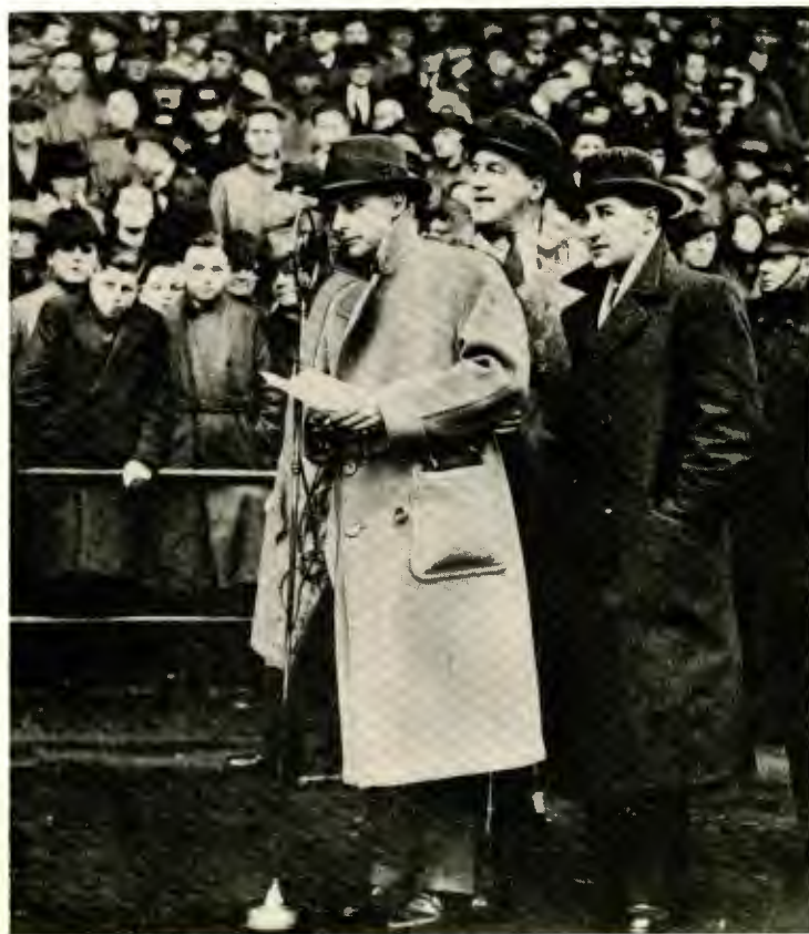
H. W. AUSTIN, tennis star, speaking to 60,000 at the Arsenal Football Ground.

BEN TILLET, Grand Old Man of British Labour.