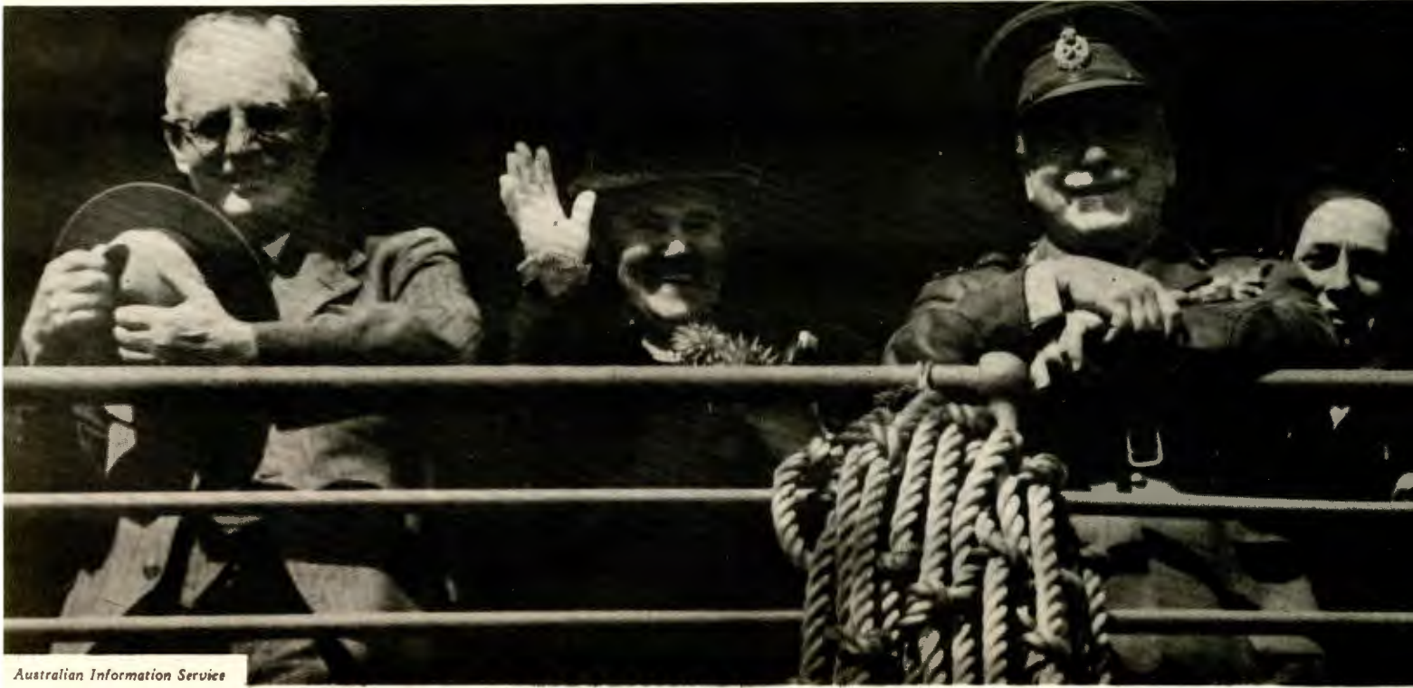
Australian Information Service

RT. HON. JOHN CURTIN, the late Prime Minister of Australia, at a critical time of war in a broadcast to Australia, called for subjection of self interest and ill will between employer and employee and the building of sound homes, teamwork in industry and cooperation throughout the nation. "By so doing we will be a nation that is morally and spiritually rearmed, and be adequate not only to meet the tasks of war but also the tasks of peace."