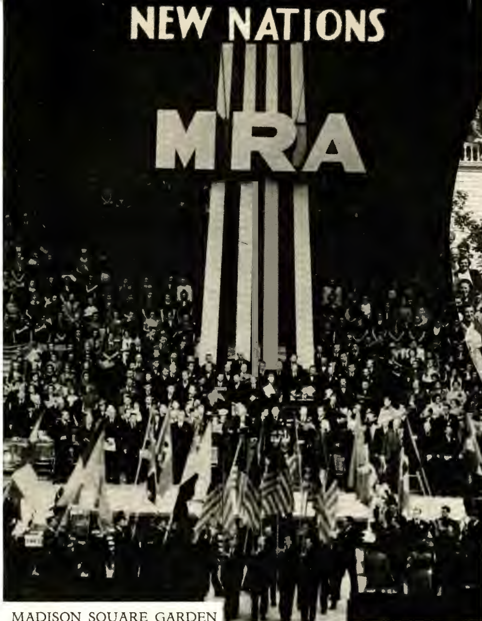
MADISON SQUARE GARDEN