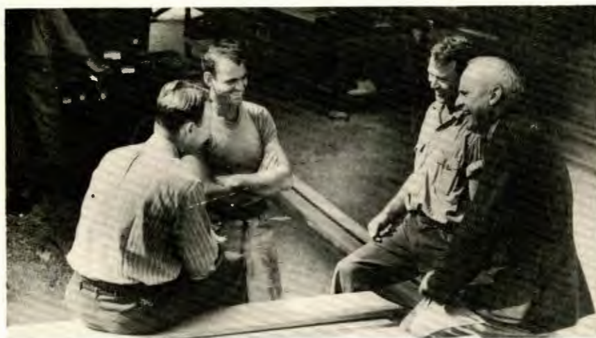
Labor-management conference in California building materials plant.