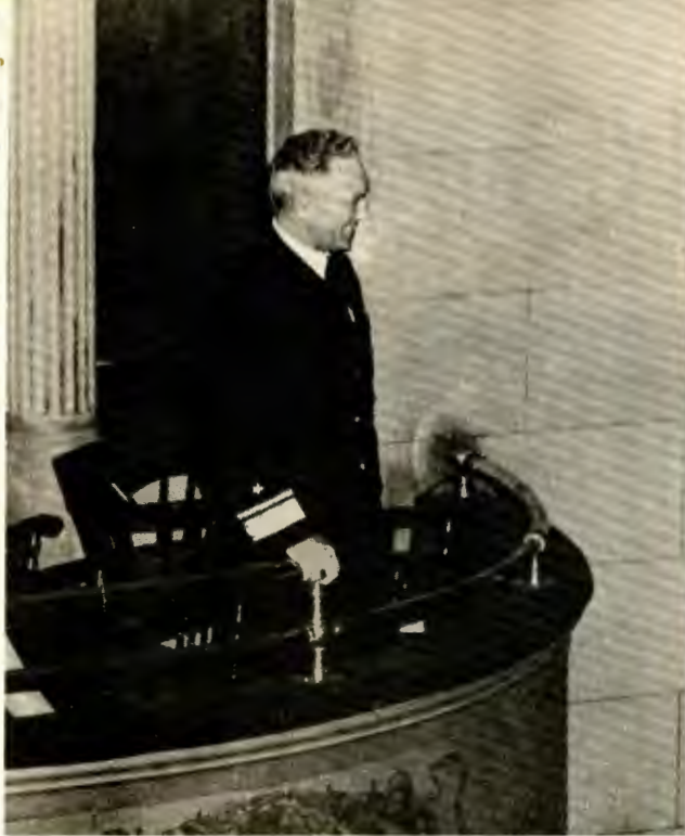
REAR ADMIRAL RICHARD E. BYRD speaking from the President's Box, National Theater, Washington, D.C.

HONORABLE HARRY S. TRUMAN HONORABLE JAMES W. WADSWORTH