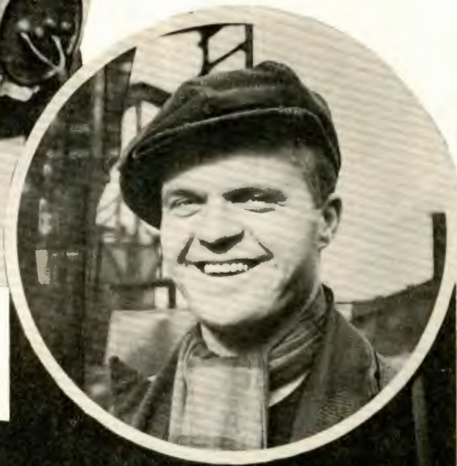
Moral Re-Armament is launched in East London, June 1938.