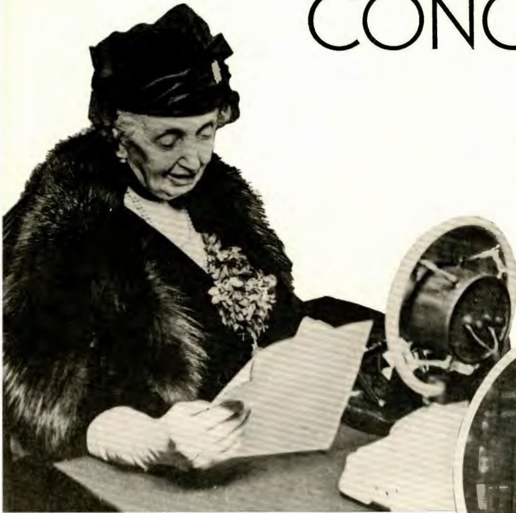
Louisa, Countess of Antrim, broadcasts to America.

For all of England that is fair Is what our dear Lord planted there; And all of England that is ill Is where we've forced our pagan will; And all of England that shall be Grows fine or false in men like me.