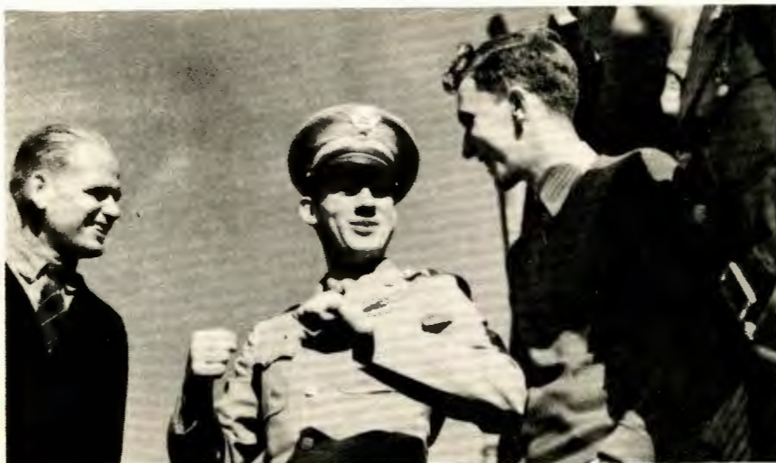
P-38 pilot talks to men who helped keep 6-year no strike record in plant which built his plane.