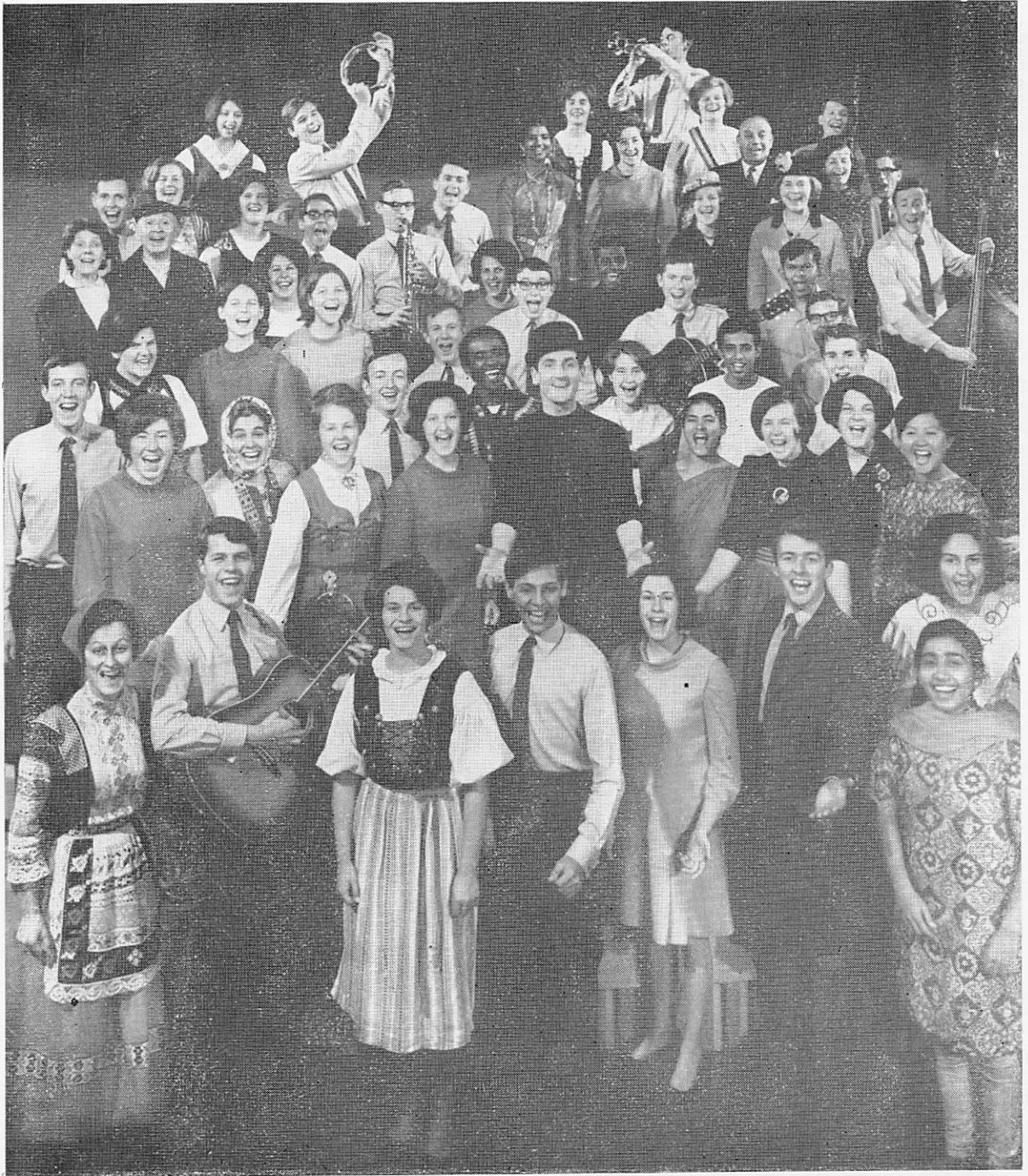
Meet the Cast and Company of "ANYTHING TO DECLARE?"